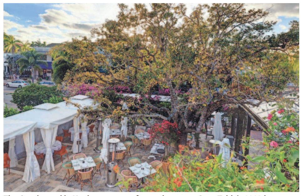
The Continental in Naples was one of two winners on OpenTable's 2022 best outdoor dining list. LORI HAMILTON