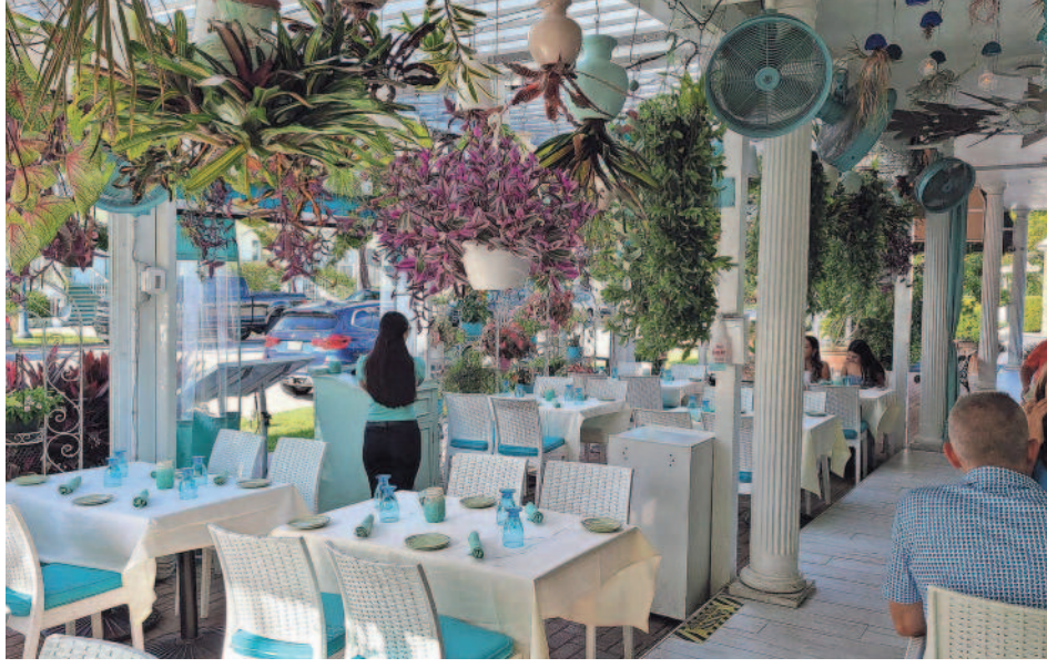
Mediterrano is one of two restaurants in Naples making the best 100 outdoor dining restaurants.

Noticing how the bulk of restaurants scoring a coveted spot were waterfront locations, Ljubenovic said, "It's an honor to be recognized and stand out on this