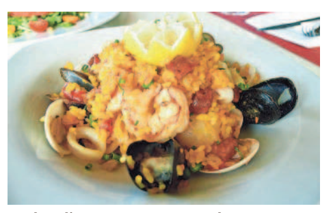
Order dinner at Lamoraga by 5:30 p.m. and score 25% off your check.

Birdie's offers one dairy-free variety on any given day. We sampled refreshing mango sorbet. Non-dairy gelato for vanilla, dark chocolate, sea-salt caramel and toasted coconut flavors use oat milk as the base.